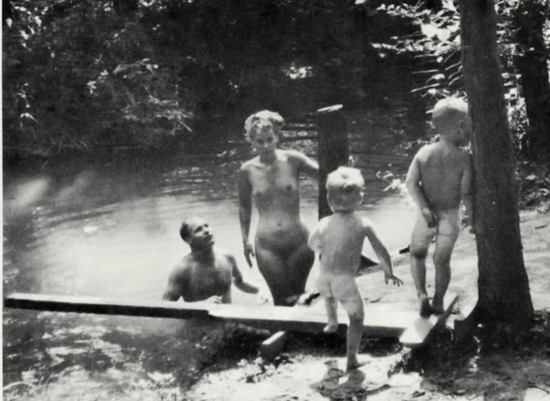
Nudity is our natural state. Young children readily attest this by their complete absence of shame. Kit and K Lawrence